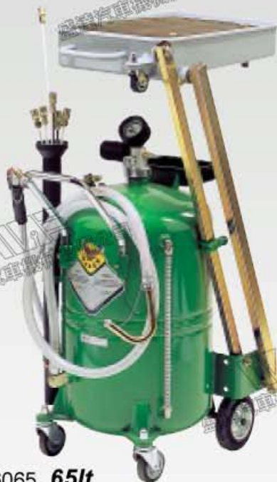
Art. 46065 65lt