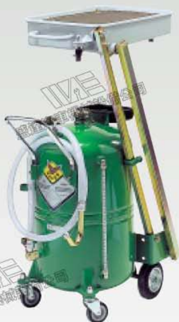
Art. 46064 65lt